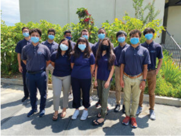
The summer 2021 student literature evangelism team.

it is like,” shared Crystal, Garver’s wife. “I brought crafts over to their house so they can participate. We had the capability to put it up online, and the cool thing is that it blessed someone.”