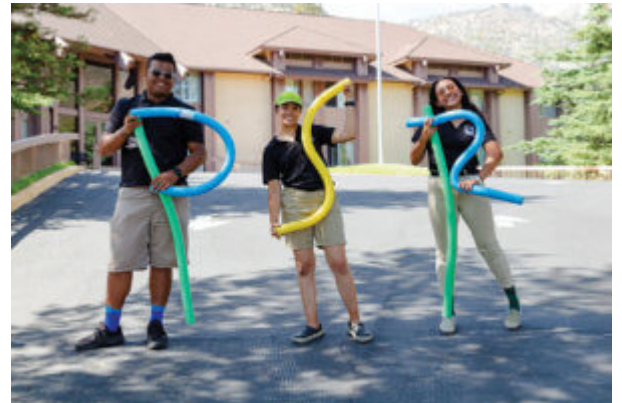
A few of the summer camp veterans who made up the Pine Springs Ranch task force. Thanks to them, PSR hosted four weeks of safe and fun Family Camp experiences.