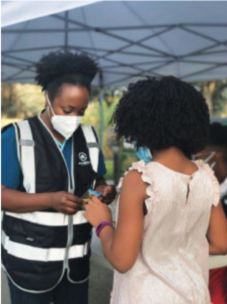
Members of the Mt. Rubidoux church help host one of their weekend drive-through Rocky Railway VBS programs.