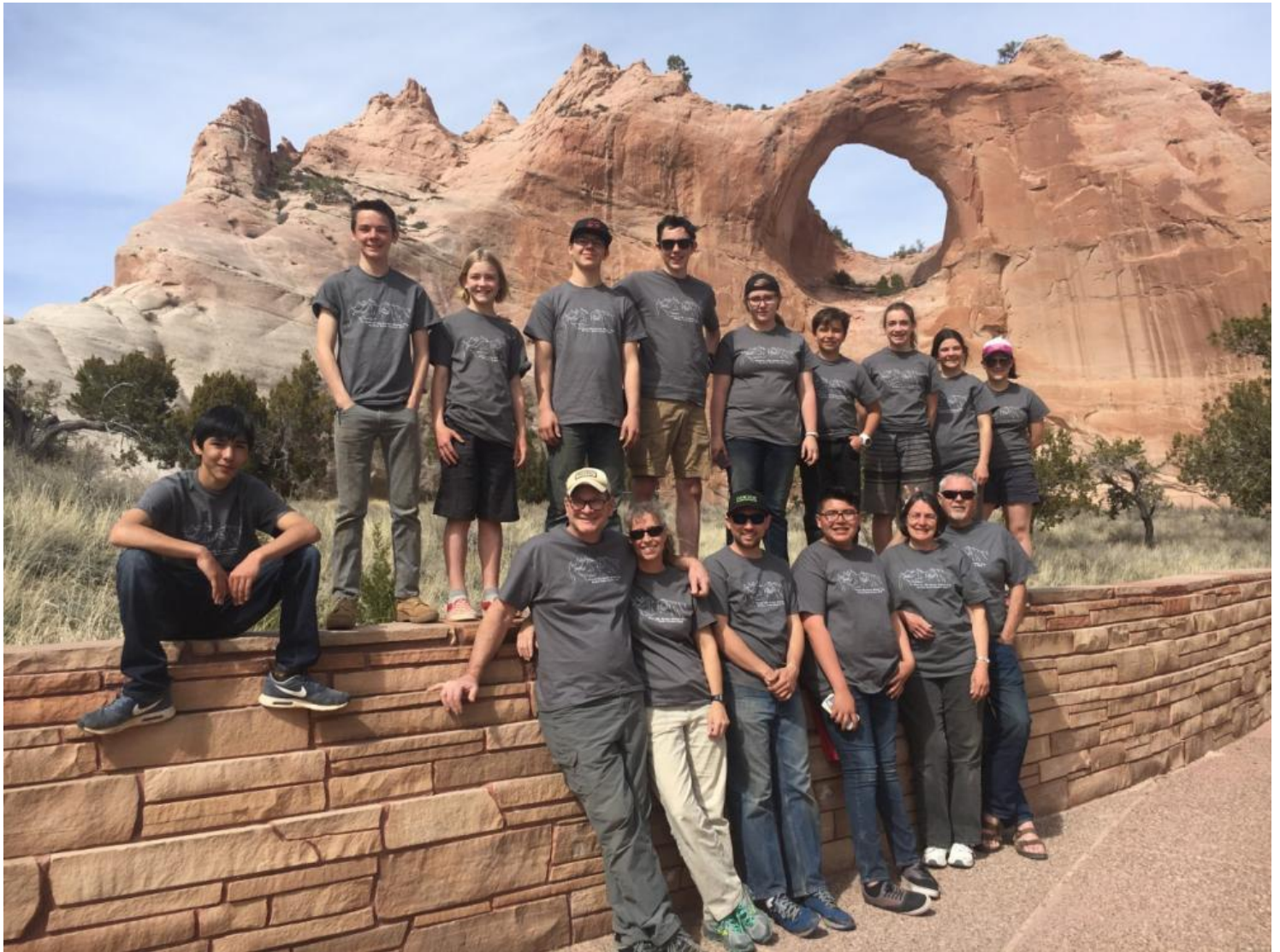
Students from Mother Lode Adventist Junior Academy pose for a photo in Window Rock, Ariz., during their trip to help a church with renovations.