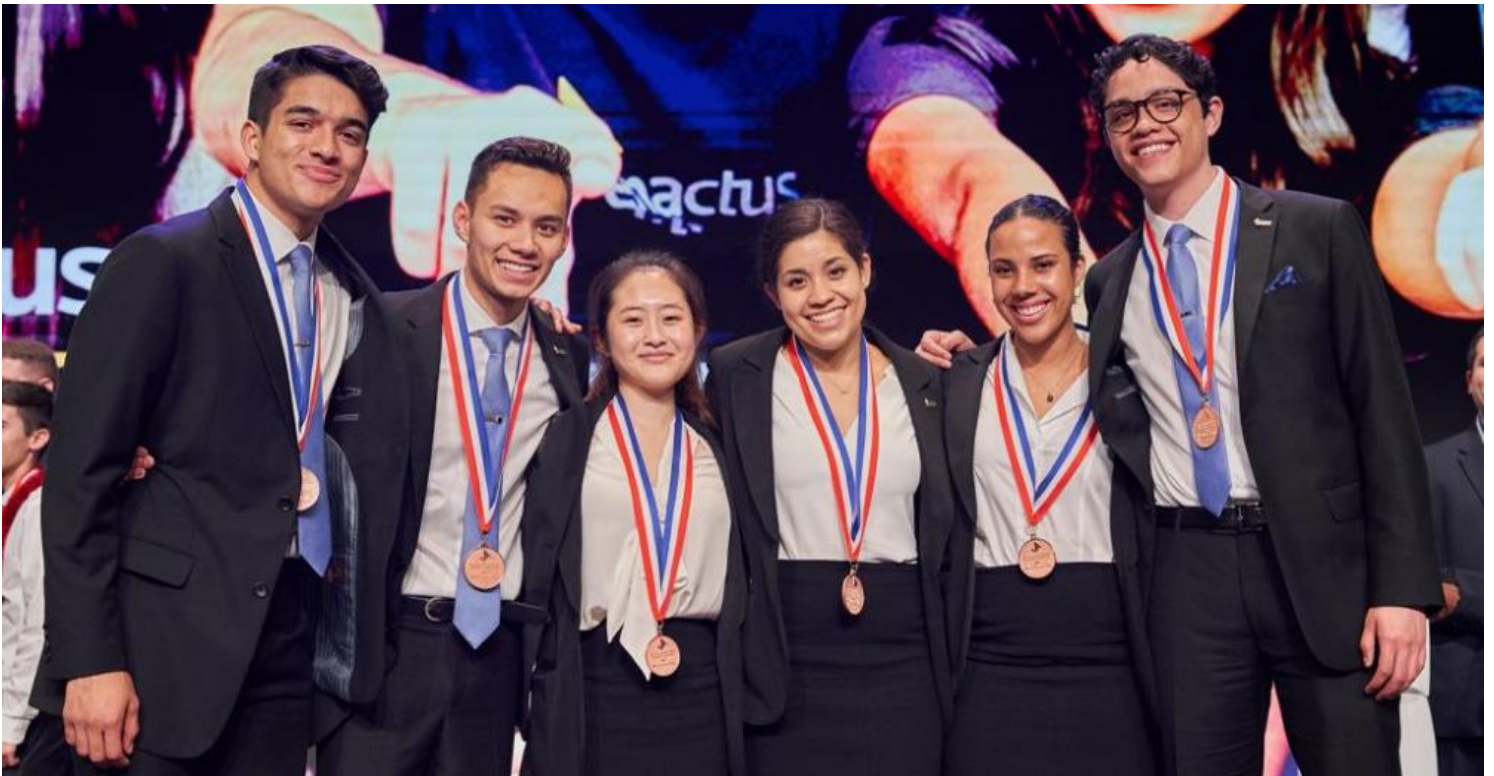
La Sierra University's Enactus team at the US National Enactus competition where they placed 3rd in the nation.